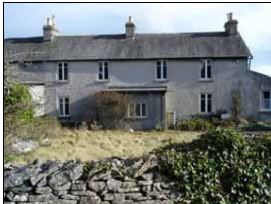
Deerholme in 2008