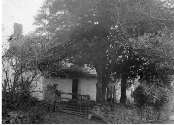
Yew Tree Cottage, Applethwaite