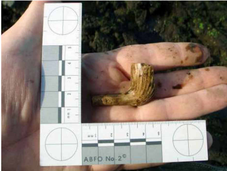
Selected finds. A clay pipe