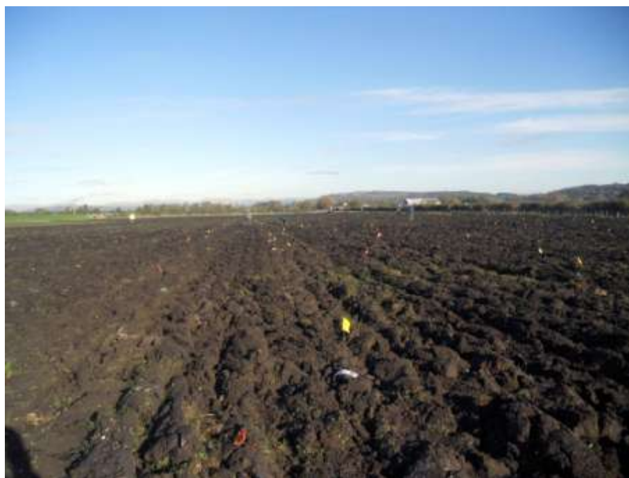
Bridle Croft field showing the flags marking the position of finds and the plastic collection bags into which the finds were placed.

A bright and sunny day greeted the first organised outing of the newly launched Levens History Group team of Field Walkers on 24 th October. Ten brave souls plodded through the clods in our first newly ploughed field (176/A) at Bridle Croft, south of the A590. Around 200 'finds' were made, ranging from clay pipes, horseshoes and nails to a great deal of miscellaneous Victorian pottery, including a couple of possibly nice inkwells. The eagerly sought for polished stone axes and arrowheads failed to materialise but then that is part of the fun and the finds nevertheless provide strong evidence for human activity in the area, even if at a somewhat later period. Geoff Cook, who organised the walk, kept everyone well under control and ensured that the survey was conducted in a systematic and rigorous manner. The exact position of all finds in the fields was logged using GPS and a complete listing of all finds is under preparation. The group learned a lot from their experience and as a consequence will be much better prepared to tackle the next field when it becomes available.