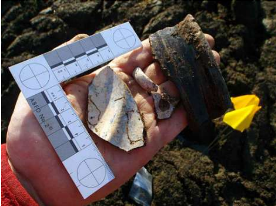
Selected finds. Miscellaneous pottery